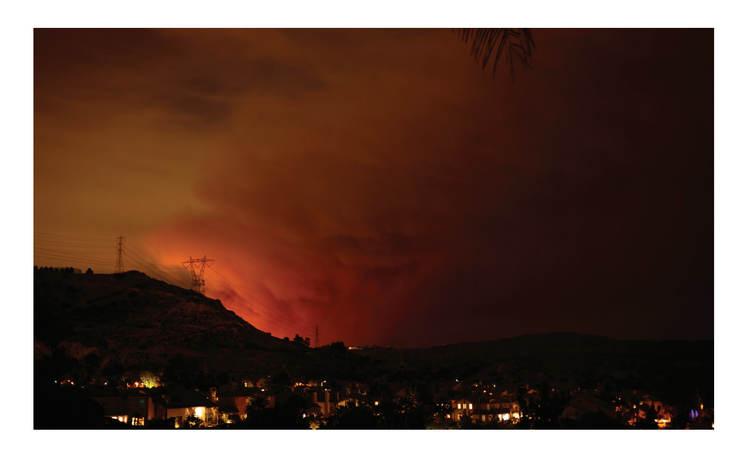
DISASTER RECOVERY: A RESOURCE FOR HOMEOWNERS BY THE MORTGAGE BANKERS ASSOCIATION © Mortgage Bankers Association, 2018. All rights reserved.

If you do not have insurance or sufficient coverage, see page 7 for disaster assistance.